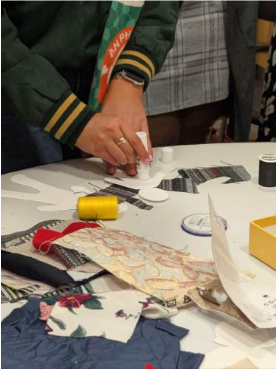
Gluing the final piece together