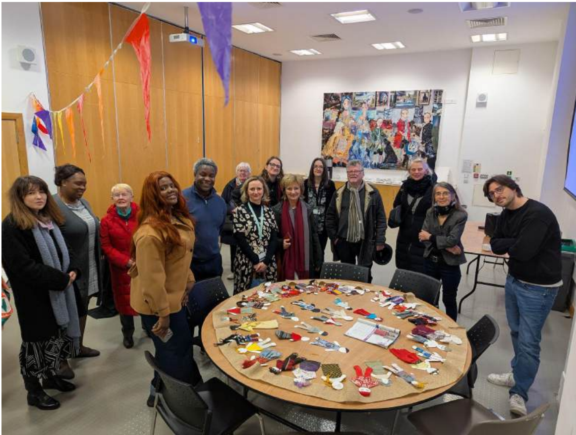
Some of the participants in front of the final dolls made