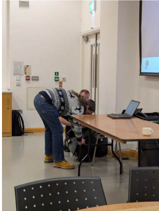
IT to the rescue