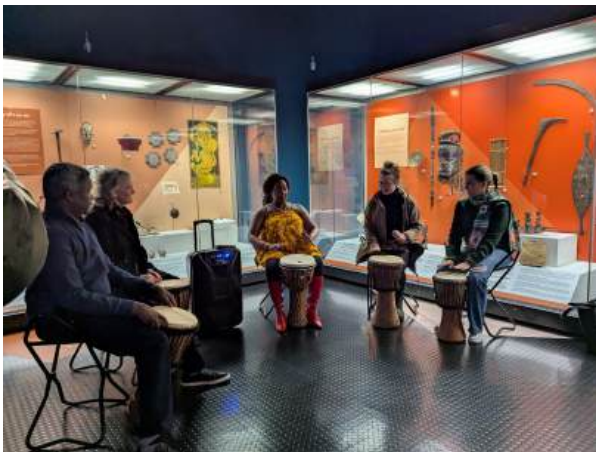
Volunteers taking part in making music