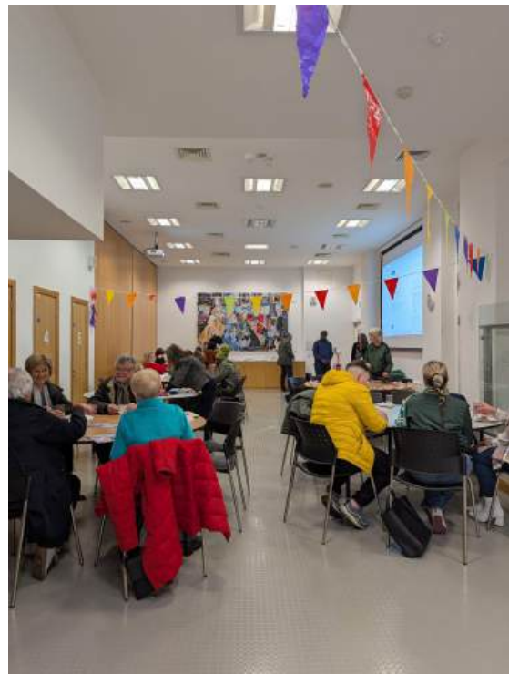
Part of the workshop