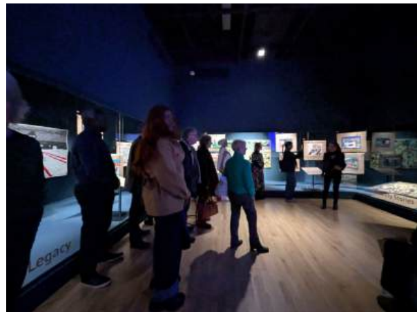
Threads of Empowerment tour